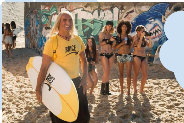
Brice de Nice, 2005